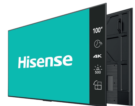
100BM66D 100" 4K UHD DIGITAL SIGNAGE DISPLAY